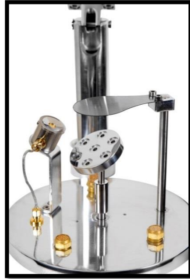
Standard sample stage

The DSR1 can be equipped with different sample stage configurations depending on the user requirements. The standard sample stage is rotatable with adjustable height, angle and can be changed easily.