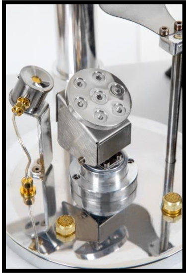
Rotary planetary sample stage